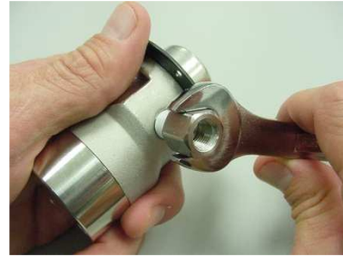
Remove the pump from the motor prior to tightening fittings